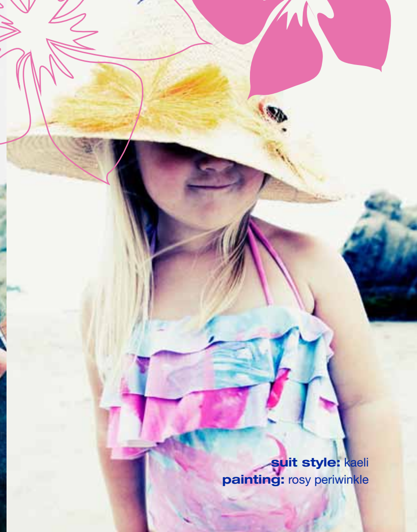
suit style: kaeli painting: rosy periwinkle