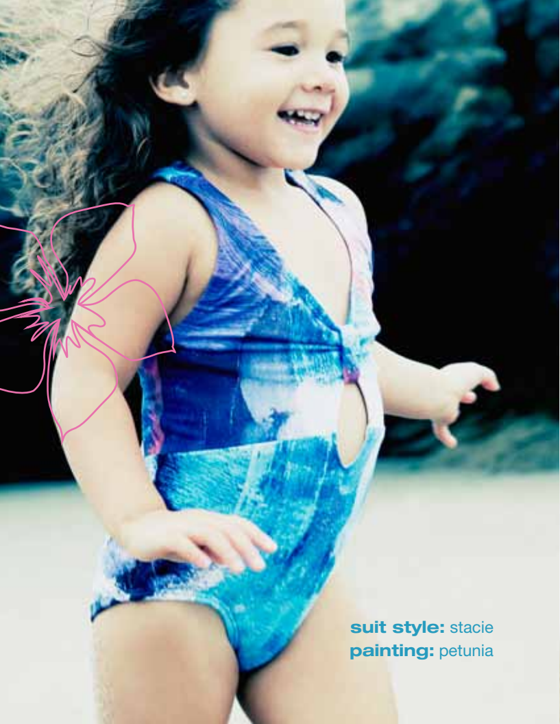
suit style: stacie painting: petunia