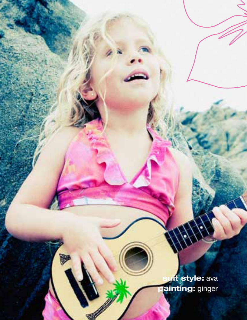
suit style: ava painting: ginger